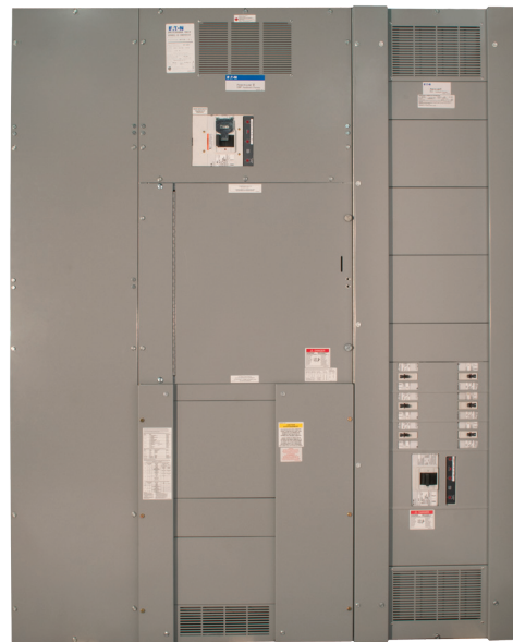
CMP with Additional Pow-R-Line 4 Distribution Panel and Wireway—Covers On

Eaton 1000 Eaton Boulevard Cleveland, OH 44122 United States Eaton.com