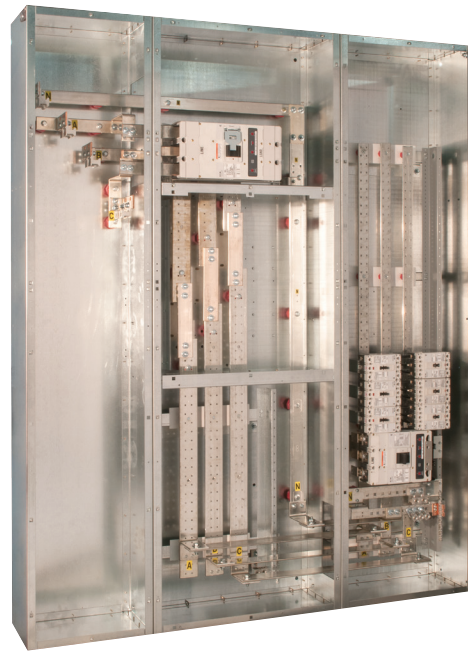
CMP with Additional Pow-R-Line 4 Distribution Panel and Wireway—Covers Off